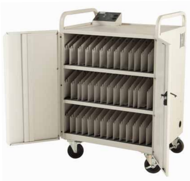
CT-NS42 Monitoring System.